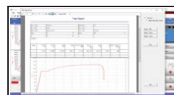
Test Result Page